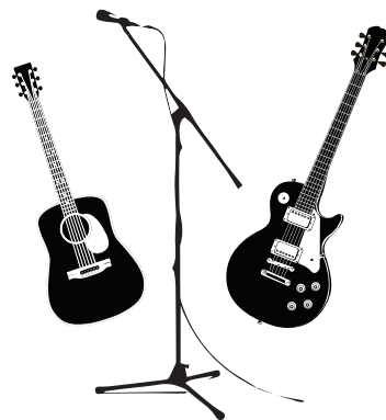
13. acoustic gtr D.I. 16. guitar 2 vocal mic