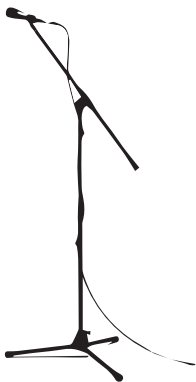
14. guitar 1 vocal mic